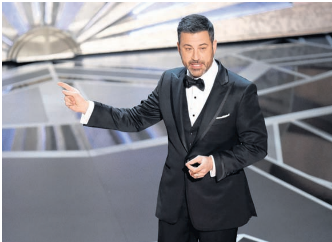
Host Jimmy Kimmel speaks at the Oscars in Los Angeles on March 4, 2018. Kimmel will again preside over the ceremony in March, the show's producers said Monday.

After the 90th Oscars in 2018, which Kimmel hosted to generally positive